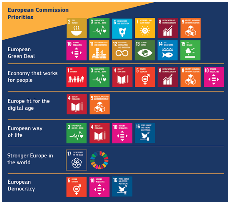
Figure 1: European Commission Priorities. Eu holistic approach to sustainable development.