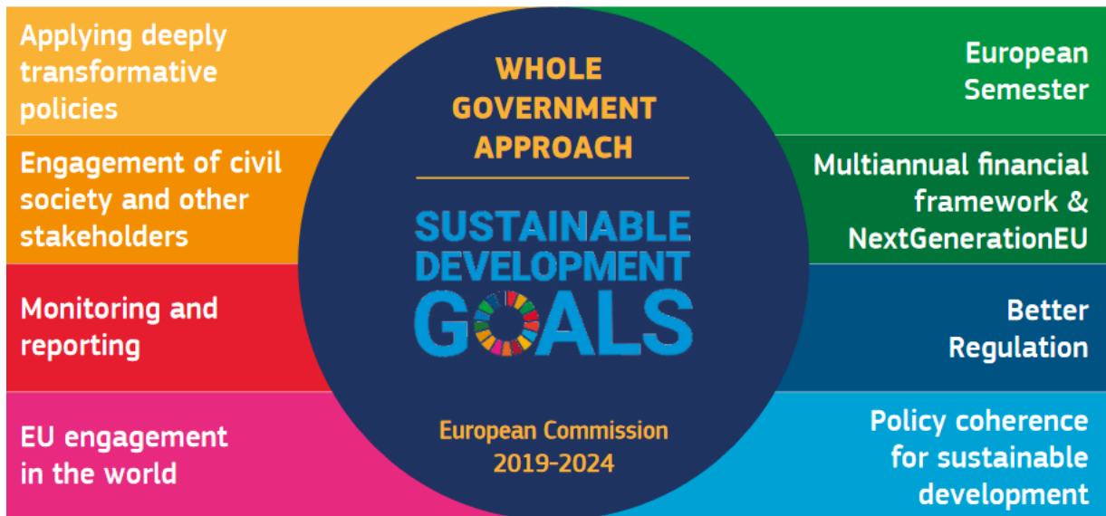
Figure 2: The new Commission’s comprehensive or “whole of government” approach to implementing the Sustainable Development Goals